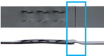
Avoids injuries: The especially shaped strap end of the TITAN "No-Seal-Joint"