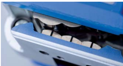
The patented sealing mechanism of the HKE

The HKE HEAVY-DUTY furthermore has a torque limit which guarantees a constant tensioning capacity.